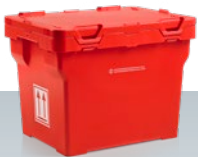
UN Box | 22 L / 6 kg Accessories: battery tray, partition wall 4H2/Y6/S../DK/ETi-23004/ Craemer GmbH Max. gross weight: 6 kg