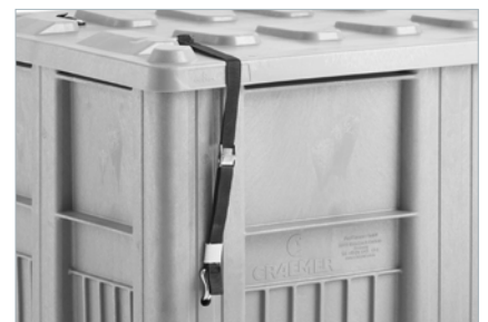
CB Pallet boxes