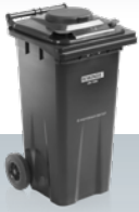
MGBneo | 120 L 4H2/Y25/S../GB/7227 Max. gross weight: 25 kg