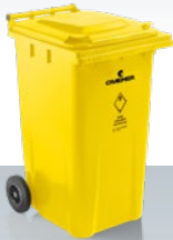
MGBneo | 240 L 4H2/Y110/S../GB/7653 Max. gross weight: 110 kg