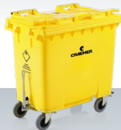
MGBneo 4 | 770 L 50H/Y../GB/CRAEMER - 7013/0/360 Max. gross weight: 360 kg