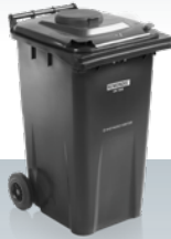
MGBneo | 240 L 4H2/Y40/S../GB/7226 Max. gross weight: 40 kg