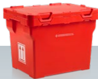
UN Box | 22 L / 10 kg Accessories: battery tray, partition wall 4H2/Y10/S../DK/ETi-23004/ Craemer GmbH Max. gross weight: 10 kg