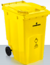
MGBneo | 340 L / 360 L 4H2/Y140/S../GB/7231 Max. gross weight: 140 kg