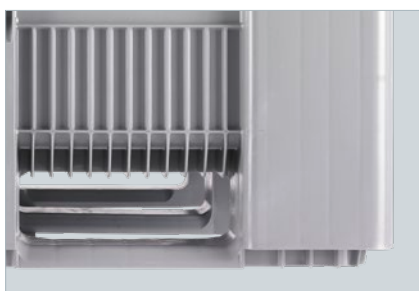
SB pallet boxes

Detailed technical specifications can be found in the respective product data sheet at www.craemer.com